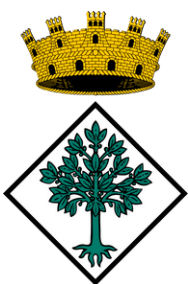
Ajuntament de Lloret de Mar