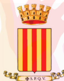
Comune di Bolsena