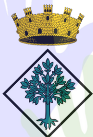
Ajuntament de Lloret de Mar

A collection of final reflections on the project